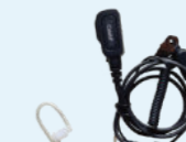
Audio tube Earpiece